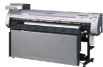
CJV30-160 equipped with a drying and exhaust unit 160